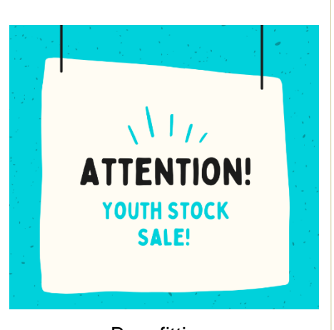
Benefitting Belize Mission Trip July 10 - 16